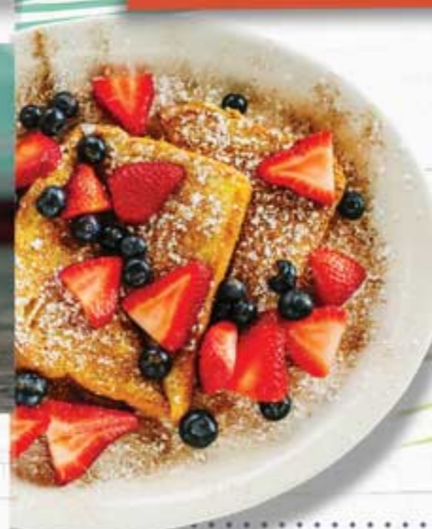
STUFFED FRENCH TOAST