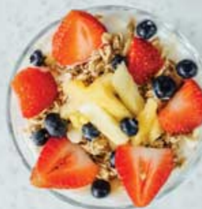
YOGURT GRANOLA PARFAIT

Creamy yogurt loaded with berries & topped with granola